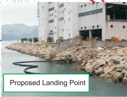
Proposed Landing Point